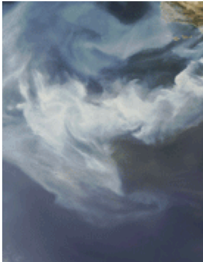
Fig. 3. Image taken by NASA Terra Satellite on October 24, 2007.